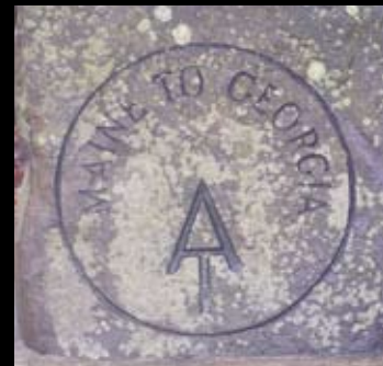
The Appalachian Trail