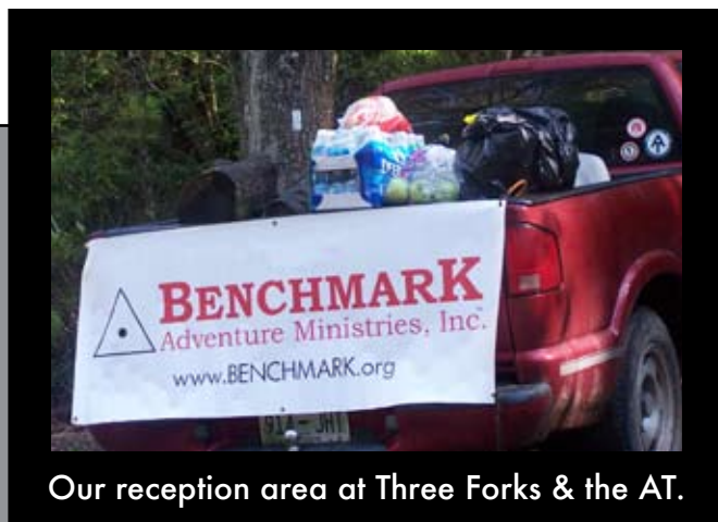
Our reception area at Three Forks & the AT.