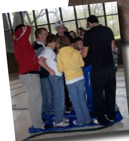
Youth from Locust Grove Free Will Baptist Church involved in active learning.